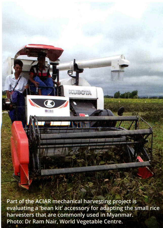
Part of the ACIAR mechanical harvesting project is evaluating a 'bean kit' accessory for adapting the small rice harvesters that are commonly used in Myanmar.