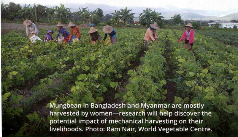
Mungbean in Bangladesh and Myanmar are mostly harvested by women—research will help discover the potential impact of mechanical harvesting on their livelihoods.

ACIAR PROJECTS: Improved mungbean harvesting and seed production systems for Bangladesh, Myanmar and Pakistan, CIM/2016/174, and International Mungbean Improvement Network, CIM/2014/079 and CROP/2019/144.