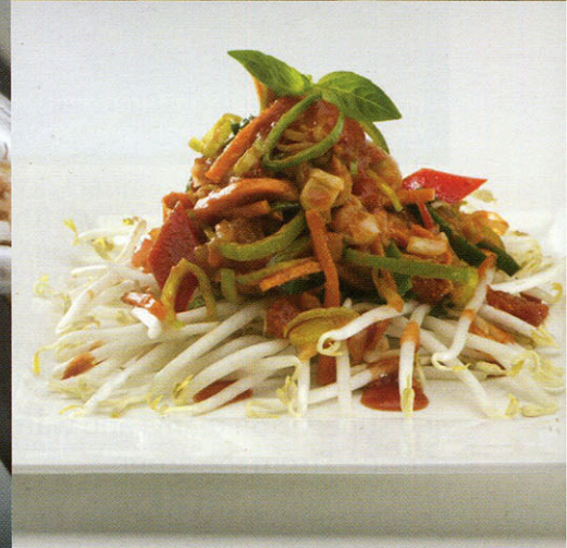
Mungbean sprouts are a popular and high-value market.