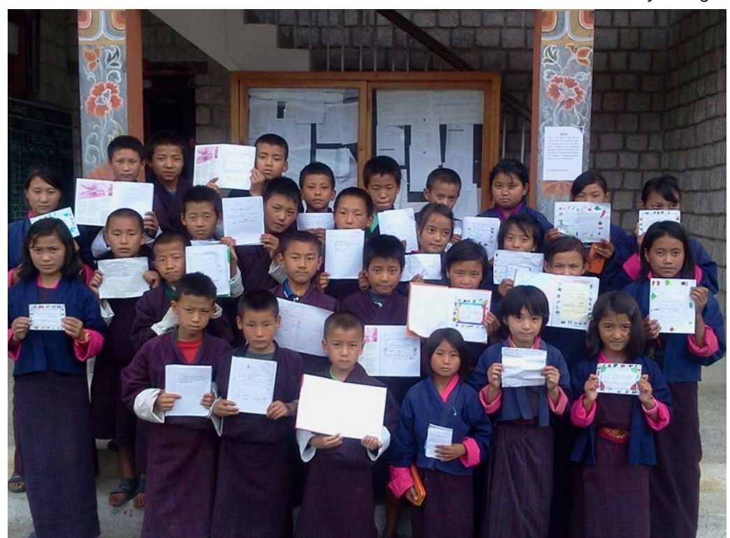
Students in Bhutan take the Healthy Pledge!

Consider distributing pledge cards to interested family members as well, to post in the home.