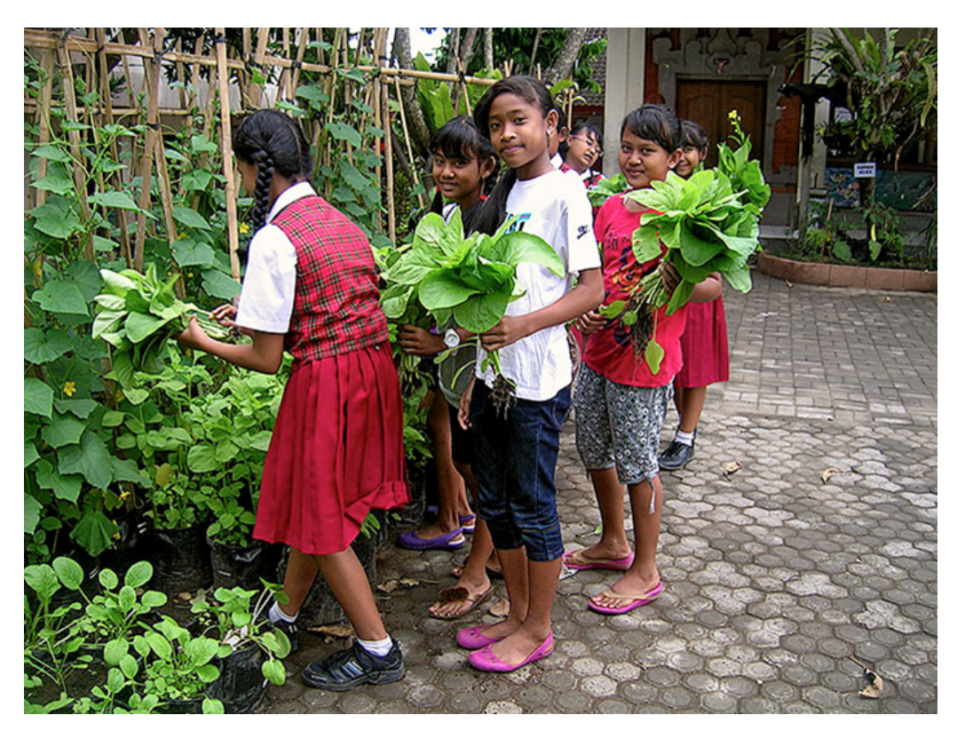
Students feel a sense of accomplishment when they can grow their own vegetables. Share their enthusiasm with your school and community!