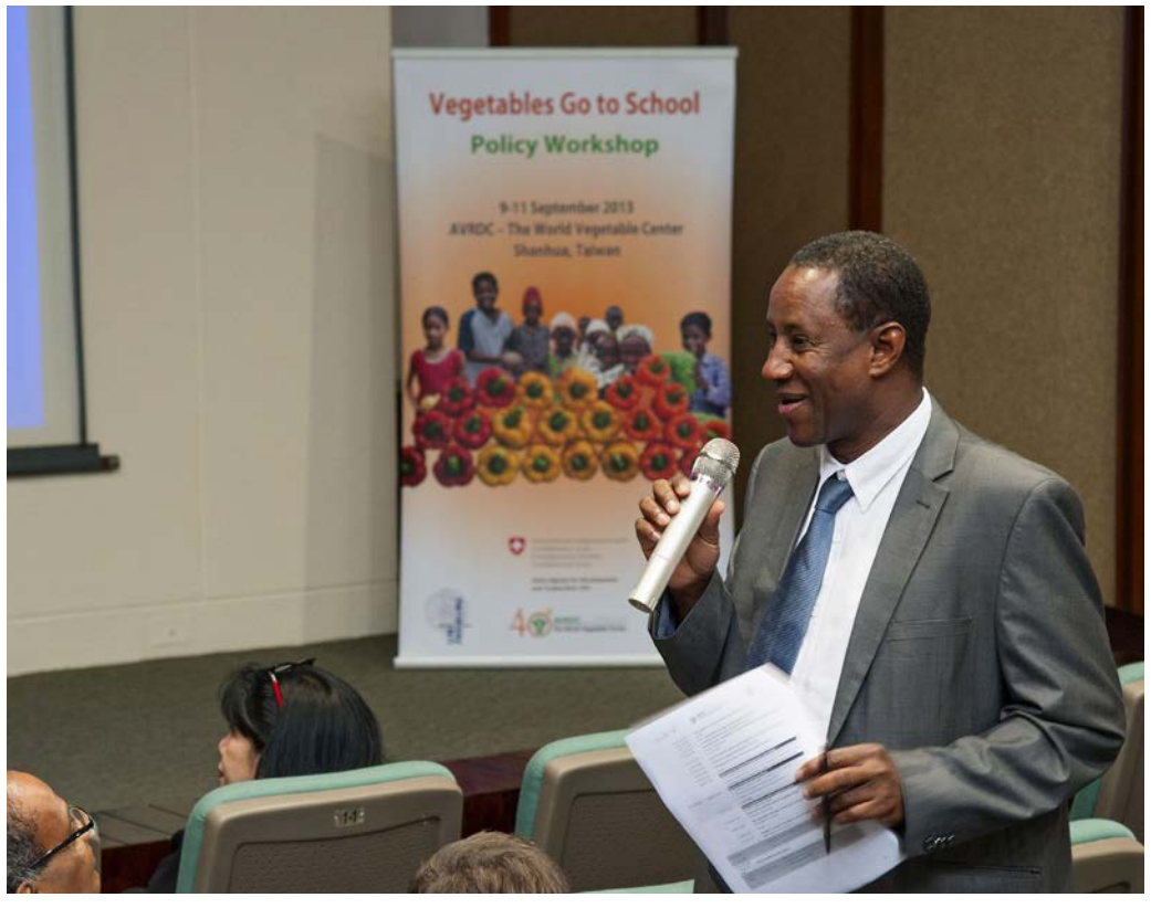
Tailor your information to your audience. Stakeholders' need for knowledge will differ, depending on their interest, education, expectations, and more.

Your messages about gardening and nutrition will differ, depending on your audience. Consider their perspective. What might some of their perceptions or concerns be about a school garden? What kind of information will they need to create, maintain and promote a garden—and eat more vegetables? How do they prefer to receive information? Follow your A-U-D-I-E-N-C-E: