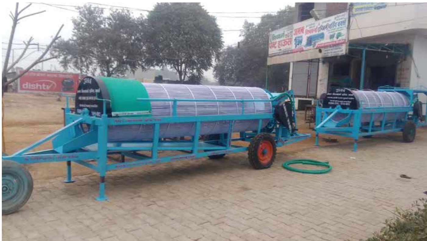
Carrot cleaning machines developed by a 6 th grade-educated mechanic in Bahawalpur village of Hisar district (top & below)

Haryana is a rice-wheat belt of north India, which contributes about 18% of food grain production for the country. Recently, farmers of Haryana have started to diversify cropping practices from rice-wheat to vegetable and other non-cereal crop production. Bahawalpur is a village located 15 km northeast of Hisar town in Haryana state, and carrot has become a very highly remunerative crop of the village in the last 10 years. However, fresh harvested carrot without cleaning usually fetches lower prices (INR3/kg) in the market. Cleaning carrots immediately after uprooting is a very tough task for farmers, especially in cold winter weather. Around 25-30 tonnes of carrots are produced per ha in this area. Cleaning is usually done through hand washing and largely by women or children laborers in many parts of India. Thus, traders and retailers usually do the cleaning before selling and they capture large margin profit.