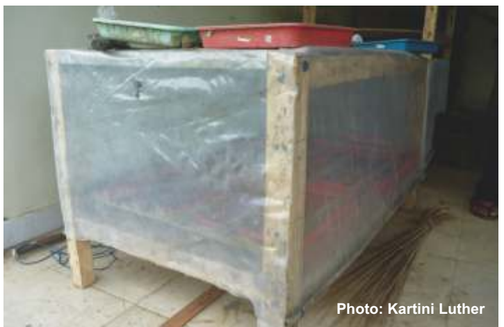
A wooden frame is completely covered with plastic sheet.