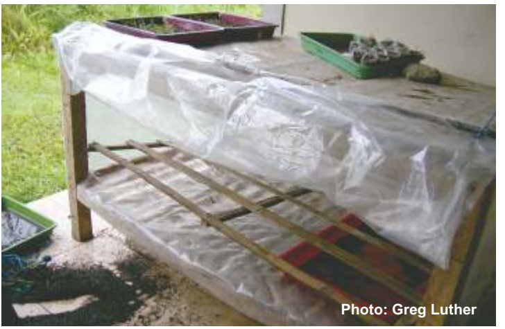
The front side can be uncovered to access the chamber and plants and for air circulation, if necessary; the lowest rack holds trays filled with water for high air humidity, the upper rack will hold trays with grafted seedlings. This grafting chamber should stand in a shaded location.