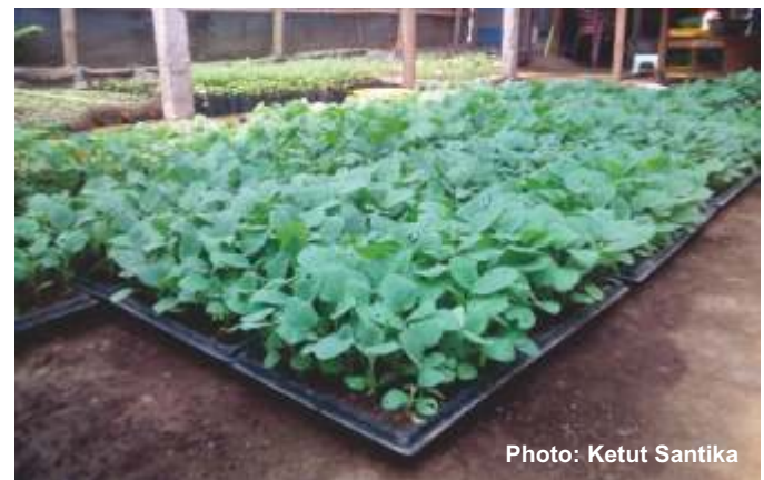
Figure 2. Seedlings in a tray