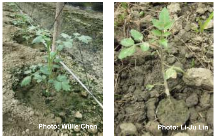
Figure 7. Transplanted tomatoes with graft union above soil

When transplanting, the graft union must be kept above the soil line. Otherwise, new roots could develop from the scion and grow into the soil, allowing diseases to bypass the resistant rootstock.