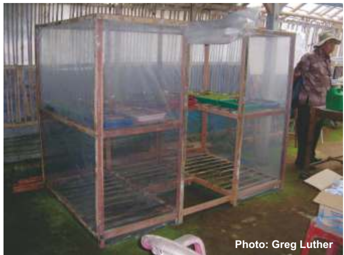
Figure 1. Example of a grafting healing chamber with two racks

Optional: a screen house can be used to grow seedlings prior to grafting and to harden the grafted plants. The screen house excludes pests, enabling growth of healthier seedlings.