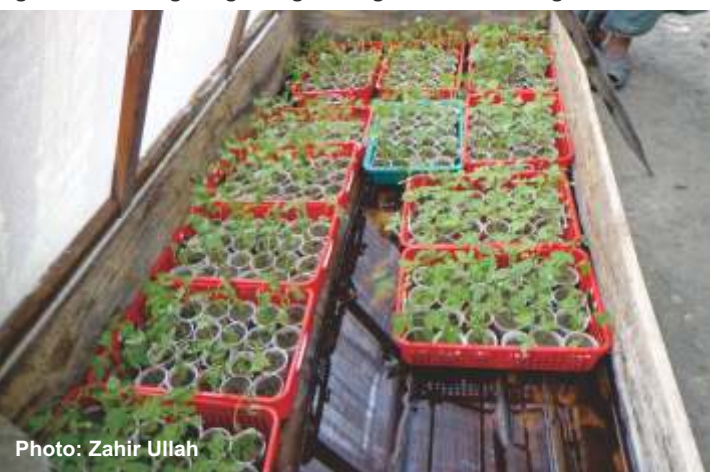
Red trays are elevated above the water with bamboo.