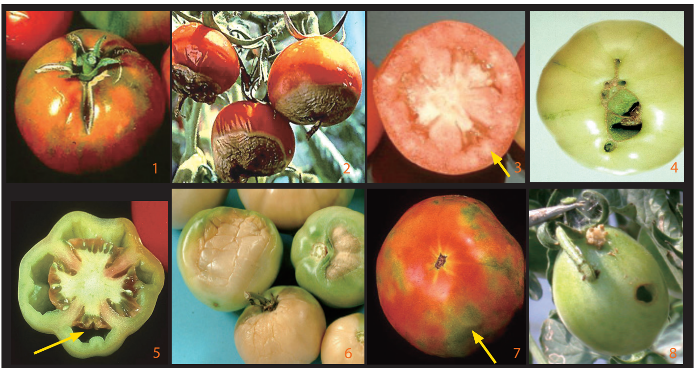
Figure 8. Nonmarketable tomato fruits.