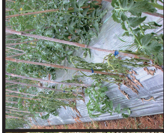
Figure 6. Typical symptoms of bacterial wilt first appear as drooping of a few young leaves. A sudden complete wilt soon follows. Infected plants display wilting but not yellowing leaves. Most of the time, leaves are still green when the plants wilt.