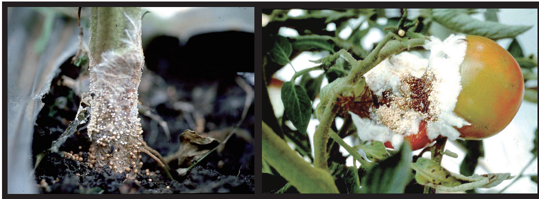
Figure 7. Symptoms of southern blight: White fungal growth is produced on the stem at the soil line and mustard seed-sized, round, tan to dark brown structures appear on the white fungal growth, leading to a rapid wilting of the entire plant.