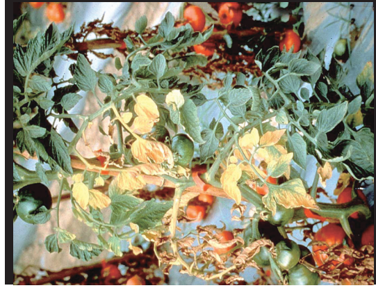
Figure 5. Symptoms of fusarium wilt: Yellowing begins on lower leaves and eventually leads to leaf drop and plant wilt.