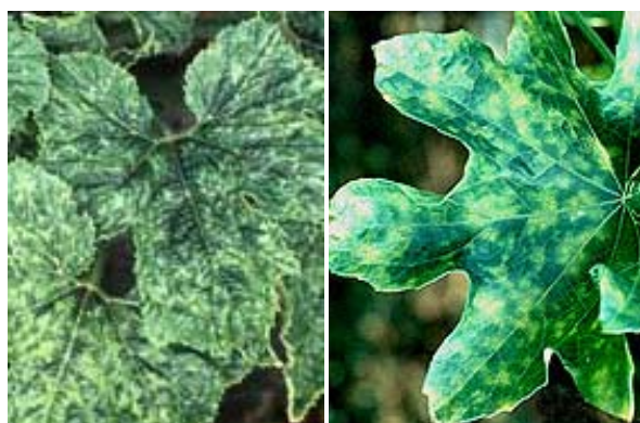
Figs. 9, 10. Symptoms of watermelon mosaic potyvirus on cucumber (left) and downy mildew on luffa (right)

Bitter gourd is susceptible to many of the same diseases that affect other cucurbits. It is a host of watermelon mosaic potyvirus (Fig. 9) and is infected by downy mildew (Fig. 10), Cercospora leaf spot, bacterial wilt, fusarium wilt, and root knot nematode. Fungal infections often occur during prolonged wet periods. Fungicide sprays may be used under such conditions to prevent infection. The use of resistant varieties is the best defense for most of these diseases.