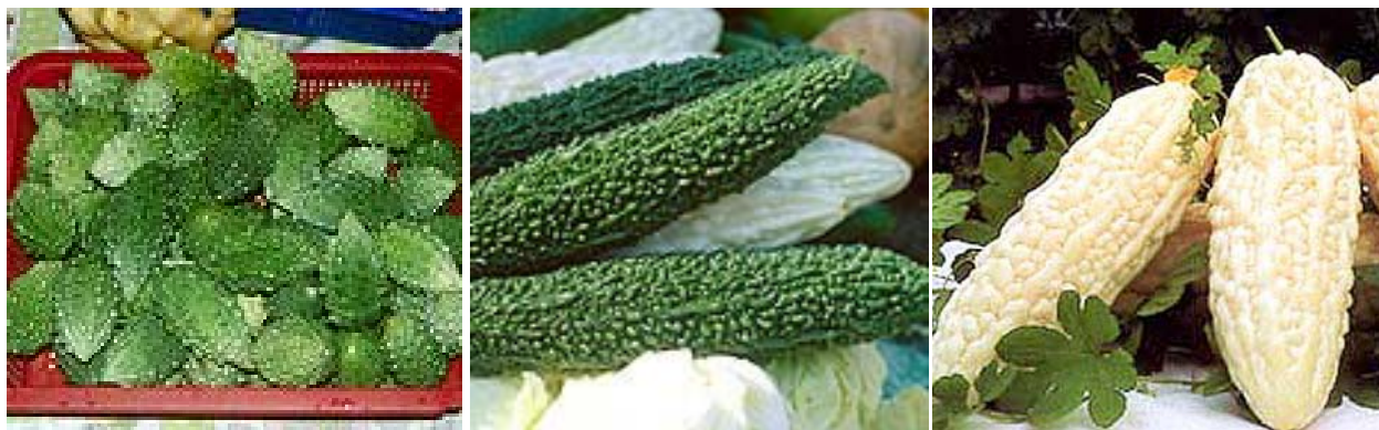
Fig. 2. Varieties of bitter melon differ in fruit size, color, ridging, and degree of bitterness

Seedlings are ready for transplanting 15–20 days after sowing or when they are 10–15 cm tall. Bare-root plants will not survive so pull seedlings with their root balls intact before transplanting. Transplant seedlings into the field at spacings similar to those used for the direct seeding method.