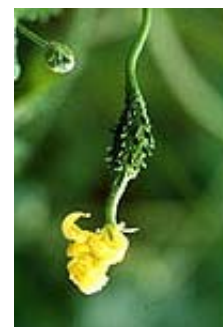
Fig. 8. Female flower

Bitter melon is monoecious, in other words, male and female flowers are borne separately on the same plant (Fig. 8). The male flowers normally exceed the females by about 25:1. Long days cause male flowers to bloom up to two weeks before female flowers, while short days have the opposite effect. Spraying vines with flowering hormones after they have six to eight true leaves will increase the number of female flowers and can double the number of fruits. For example, one application of gibberellic acid at 25–100 ppm increases female flowers by 50% and can work for up to 80 days. Other hormones have similar effect, but may reduce vine length and leaf area resulting in decreased total yield. As mentioned earlier, pruning the lower lateral branches increases the number of flowers per plant by increasing the number of flowers on higher laterals.