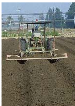
Fig. 3. Forming raised beds

Thorough land preparation and a well-prepared bed is required. Plow, harrow and rototill the field. Form 20-cm-high beds during the dry season and 30 cm or higher during the wet season using a plow or mechanical bed shaper (Fig. 3). The distance between centers of adjacent furrows is about 150 cm with a 90-cm bed top (Fig. 3).