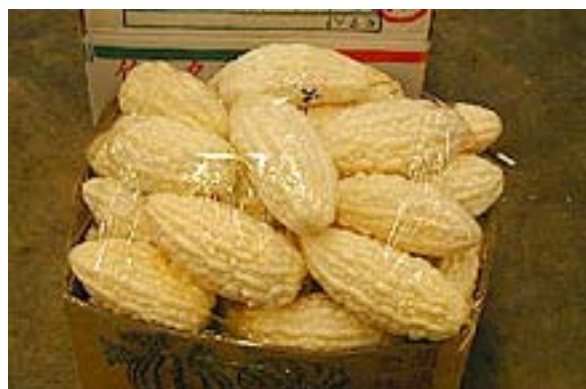
Fig. 12. Bitter gourd boxed and wrapped for shipping

Fruits of bitter gourd do not keep long and should be sold in the market immediately. Remove damaged and deformed fruits. Carefully arrange fruits in bamboo baskets or boxes (Fig. 12) and store in a cool place at 12–13°C with 85–90% relative humidity. Under this condition, fruit storage life can be extended 2–3 weeks. Bitter gourd is chilling sensitive and damage may occur if kept below 10°C. Do not store fruits at temperatures above 13°C, as this will result in fruits turning yellow and splitting open. Keep harvested fruits away from other fruits (such as banana, pineapple and apple) that release large amounts of ethylene, a ripening hormone. ☞