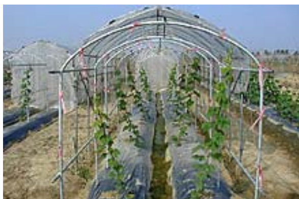
Fig. 6. Tunnel trellis structure