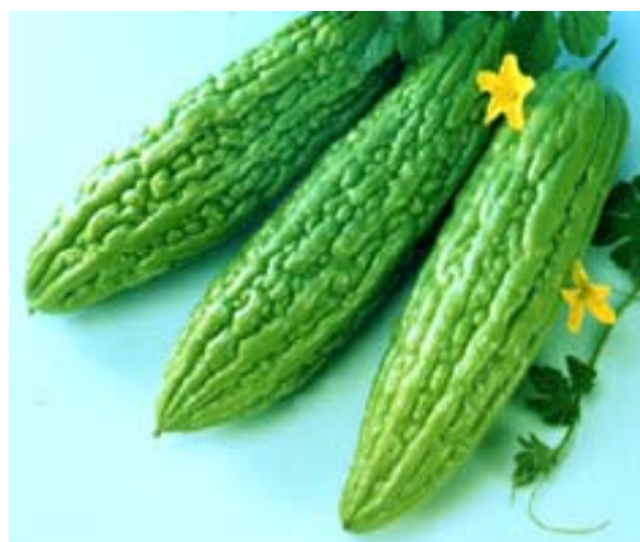
Fig.1. Bitter gourd is well-liked in Southeast Asia for its uniquely-flavored fruits and tender vine tips

Bitter gourd grows well under the same conditions preferred by other cucurbits. It is normally grown as an annual crop, but can perform as a perennial