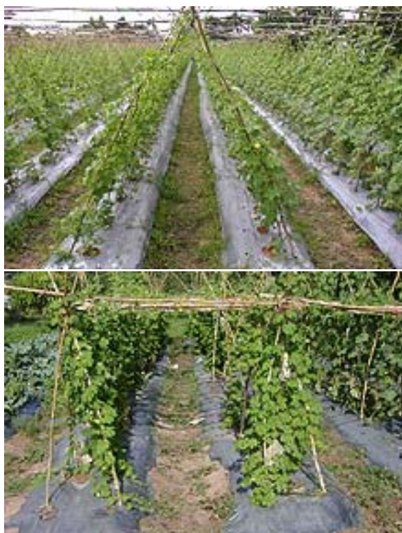
Figs. 4,5. Lean-to trellis structures

Bitter gourd develops many side branches that are not productive. To improve yield, remove lateral branches until the runner reaches the top of the trellis. Leave 4–6 laterals and cut the tip of the main runner to induce early cropping. Removal of lateral branches in the first 10 nodes has a positive effect on total yield. Without pruning, most of the female flowers occur between the 10 th and 40 th nodes, or at a height of 0.5–2.0 m.