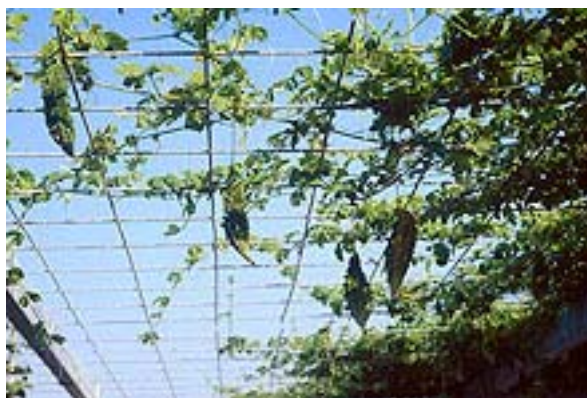
Fig. 7. Horizontal trellis on top of structure