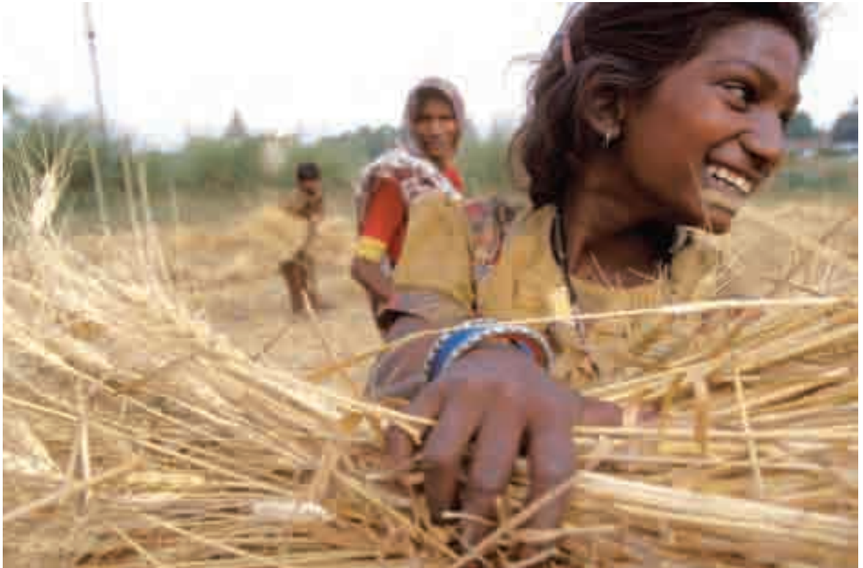
Family harvests wheat, India.