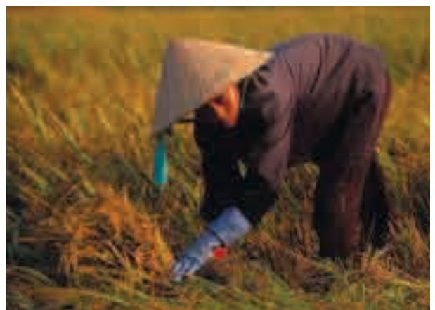
Farmer harvests rice, Vietnam.

In Vietnam, a series of similar reforms between 1987 and 1993 fundamentally shifted the country's economy to a greater market orientation, immediately transforming the agricultural sector. During the period 1989–92, the agricultural sector emerged from its stagnation and grew at a rate of 3.8 percent per year, while the country shifted from being a net food-importing country to the world's third largest exporter of rice in 1989. Within a decade, more than 10 million households—representing about 87 percent of peasant households—had received land-use certificates for about 78 percent of Vietnam's agricultural land. These reforms, together with other market liberalization policies, encouraged farmers to produce food staples, livestock, and high-value crops far more productively, and for substantially greater market gain, than