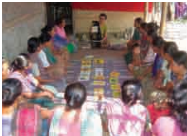
Nutrition education class, Bangladesh

Complementary investments. Still, science and technology are not enough: sustained public investment in the hardware and software of agricultural development is also critical. This includes public investment in irrigation schemes, rural road networks, rural education, market infrastructure, and regulatory systems. Long-term public investment in the building