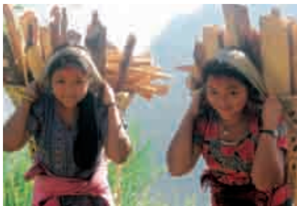
Participation in community forestry, Nepal.

By the 1970s, concerns emerged over the equity and environmental implications of rapid agricultural development. These new concerns encouraged a move away from a strictly yield-increasing outlook on food staple productivity to a more complex perspective on agriculture and rural development. Sustainable development issues came to the forefront of the development discourse, partly in response to issues accumulated during the Green Revolution, such as the overuse of agricultural chemicals, the depletion of scarce water resources, and the neglect of farmers' input into policymaking. New policies, programs, and investments were specifically designed to integrate rural communities into decisionmaking processes