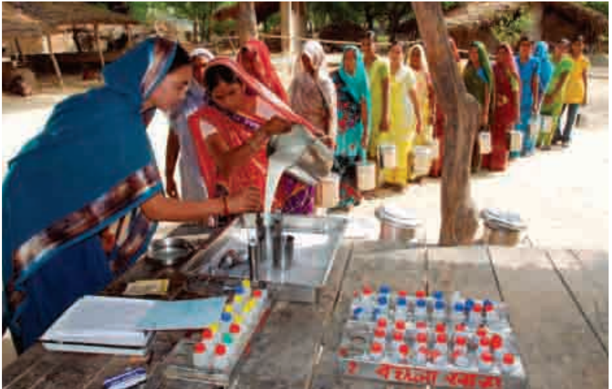
Smallholder dairy producers measure milk, India.

In India, Operation Flood, an innovative national program that ran from 1970 to 1996, helped create a national dairy industry that integrated small-scale farmers—many of them women—with village-level dairy cooperatives, commercial dairy processors and distributors, and new technologies to modernize the industry. With the backing of a supportive policy environment that ensured the dairy industry's steady growth and development, India went from being a net importer of dairy products to a major player in the global dairy market. Between 1970 and 2001, dairy production in India increased at the respectable rate of about 4.5 percent per year, with estimates during 2007–08 indicating that dairy production has exceeded 100 million tons per year. As a result, millions of consumers now have better access to milk and other dairy products.