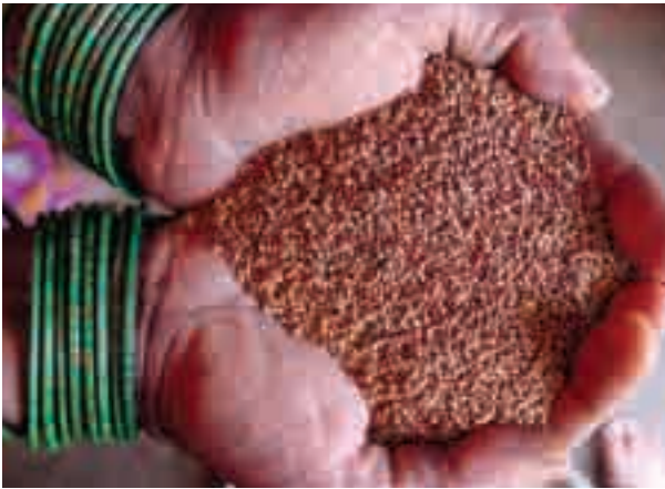
Millet seed ready for planting, India.

Timing and planning. Many successes result from good timing, whether by chance or design. In some cases, the time was simply right for the intervention—the technological, economic, social, and political elements were all in place. In other cases, the intervention was adjusted to ensure that the timing was right: gradual reforms were undertaken step-by-step, calculated measurements of the potential gains and losses were carried out, and a strong degree of support was provided to those affected by the reforms.