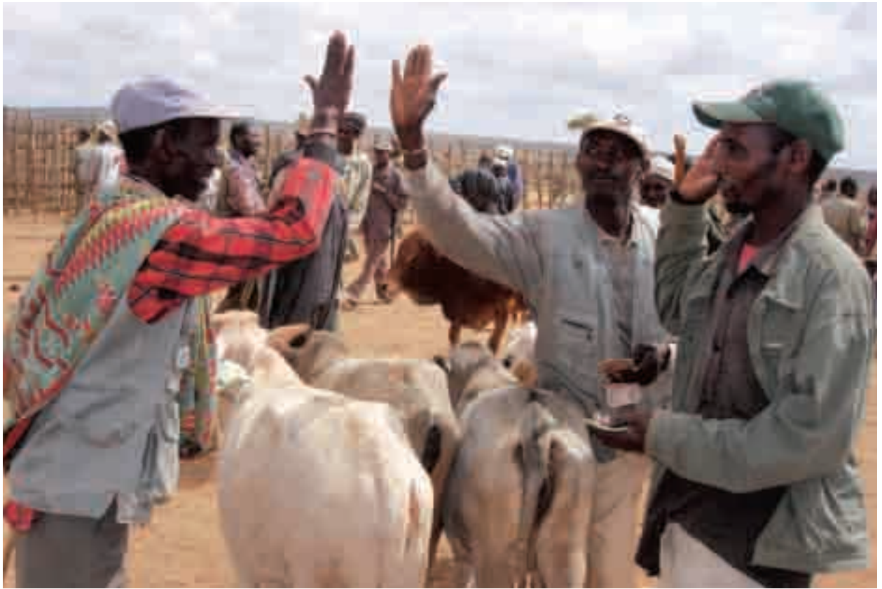
Trading healthy cattle, Ethiopia.

of land in the Indo-Gangetic Plains and generating average income gains of US$180-340 per household, particularly in the Indian states of Haryana and Punjab.