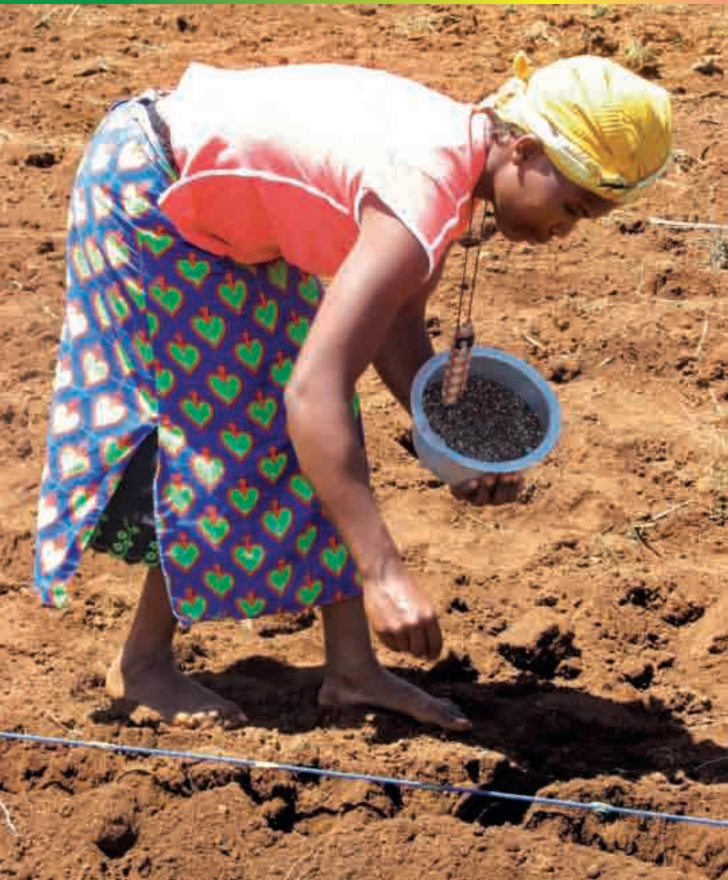
Farmer applies fertilizer to maize, Kenya.