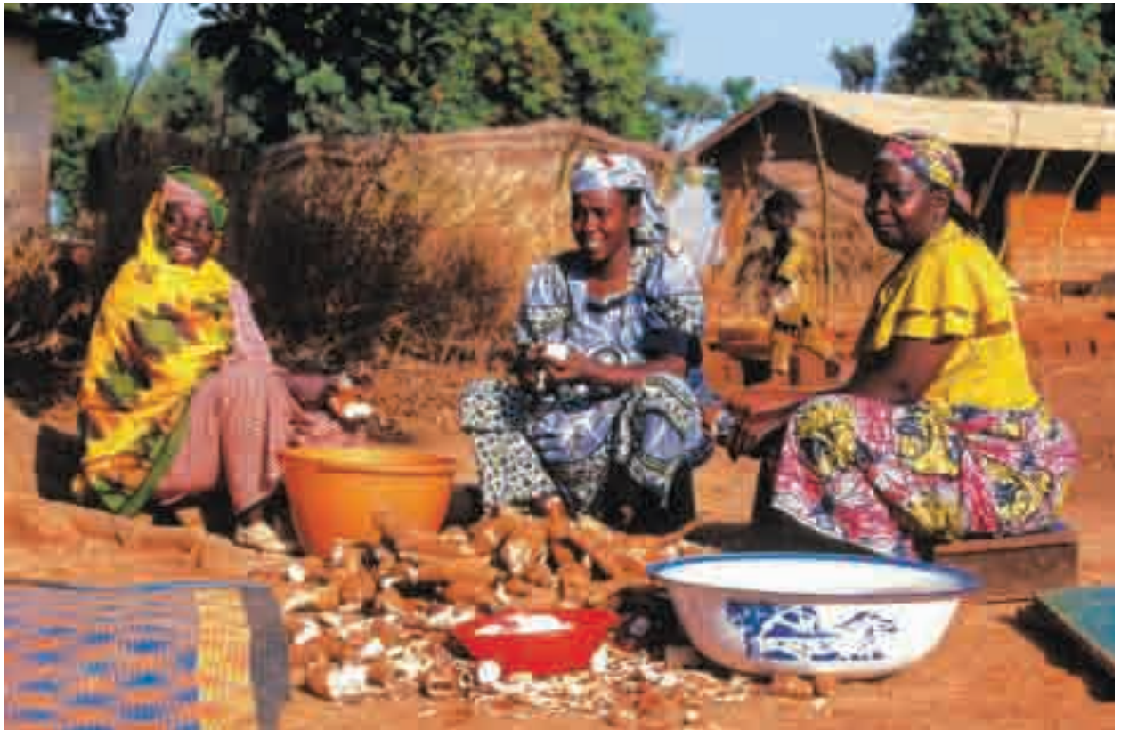
Processing cassava, West Africa.

to finding scientific solutions to ending hunger and food insecurity.