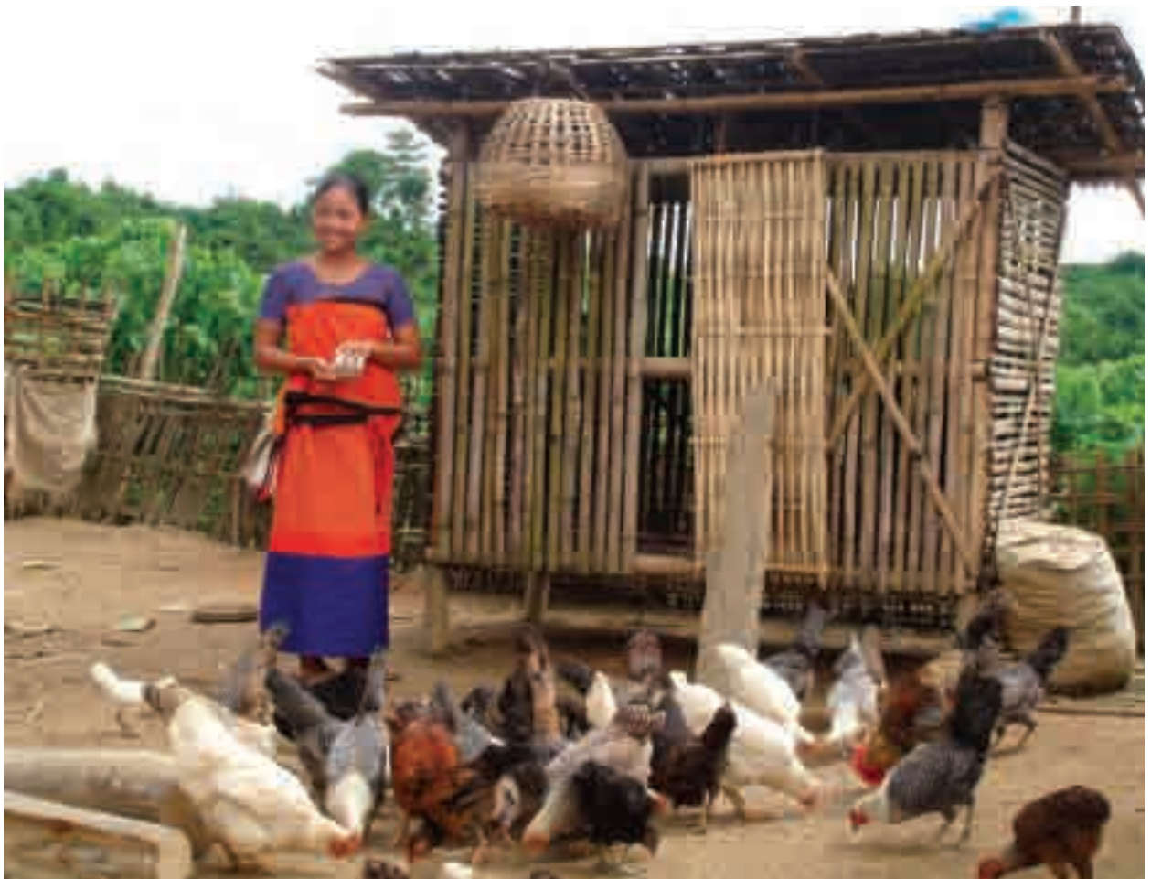
Smallholder poultry farming, Bangladesh.

Taking aim at this challenge is an innovative program in Bangladesh that promotes home gardening, small livestock production, and nutrition education. Helen Keller International (HKI), a nongovernmental organization, worked in partnership with more than 70 local