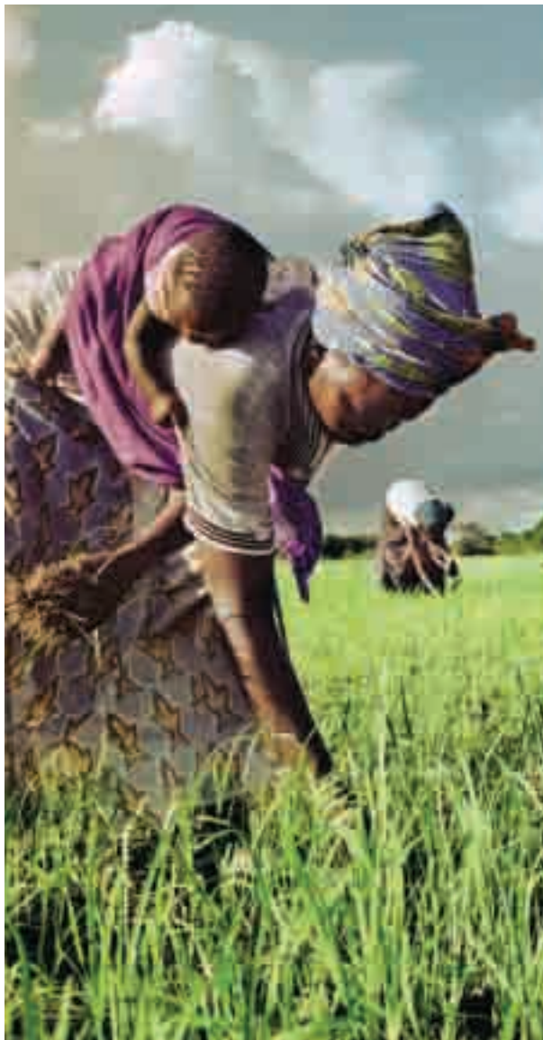
Mother and child farming together, Kenya.

nongovernmental organizations, farmers began innovating on simple practices: protecting and managing indigenous trees and shrubs among crops to provide fodder and firewood and to improve soil fertility; digging pits on barren, degraded land to concentrate organic manure and rainwater for planting; and constructing