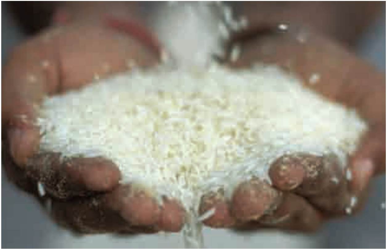
Freshly milled rice, India.

to account for 90 percent of the increase in rice production in Bangladesh between 1988 and 2007. And with this growth in rice production came a decline in the real rice prices facing food-insecure households and ultimately significant reductions in poverty in the country.