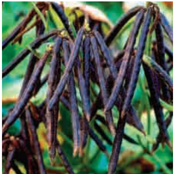
Mungbean cultivation, Asia.

Global efforts to control and eradicate rinderpest—a livestock disease that, in its severest form, is capable of killing 95 percent or more of the animals it infects—reiterate the importance of livestock to rural livelihoods and food security. Concerted global, regional and national efforts in recent decades to control the spread of rinderpest through cattle vaccination, quarantine measures, and disease surveillance have played an important role in securing the livelihoods of small-scale farmers who keep livestock, as well as pastoralists whose livelihoods depend primarily on the health of their herds. Programs operating in Asia and Africa have helped to avoid potentially massive financial losses in terms of milk, meat, animal traction and, for many pastoralists, their main livelihood assets, and have brought rinderpest to the edge of eradication, the first time a disease has been eradicated since smallpox in humans.