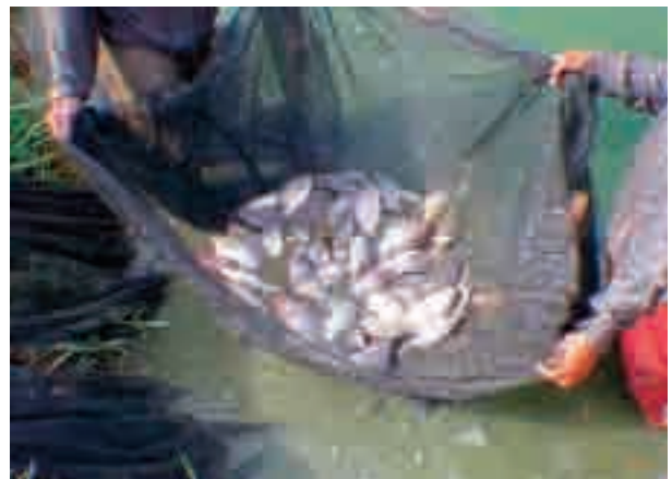
Harvesting farmed tilapia, Philippines.

from 1988 to 1997 played an important part in enhancing the role of fish as a source of income and protein for many farmers and consumers. By breeding a tilapia strain that originated in Africa, the project developed a new strain that is faster growing and more