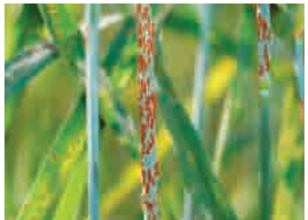
Wheat infected with stem rust.

One of the first major successes came from a global effort to fight wheat rusts—a plague that has been known to humanity for thousands of years but had never been effectively contained. Wheat rusts are actually fungi that can rapidly decimate wheat as it matures in the field, and are thus a threat to food security in industrialized and developing countries alike. The late Nobel Prize Laureate Norman Borlaug, with the eventual backing of policymakers, scientists, and philanthropists, catalyzed a global effort to combat the scourge by bringing modern science to bear on the problem—by breeding rust-resistant wheat varieties in Mexico with the help of innovative research methods. This global effort helped protect about 117 million hectares of land under wheat cultivation from wheat rusts, directly ensuring the food security of 60 to 120 million rural households and many more millions of consumers. Importantly, this global effort also secured a place for science and technology in developing-country agriculture and gave rise to a global agricultural research system, including the Consultative Group on International Agricultural Research, dedicated