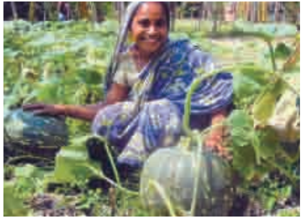
Homestead food production, Bangladesh.

Yet investments in agricultural development have generated sizable dividends for society, demonstrating that agriculture is not only an important means of reducing poverty, but also a worthwhile investment portfolio.